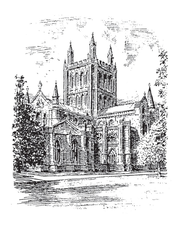
An inclusive church welcoming everyone