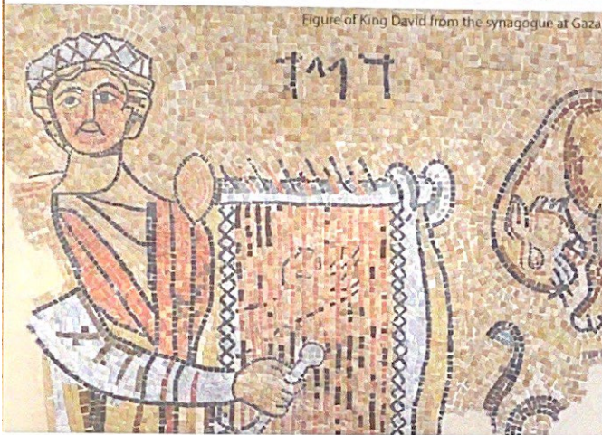
Figure of King David from the synagogue at Gaza

Lord our God, who long prepared the way for our salvation, give us hearts to love you and a will to seek your kingdom, where your true anointed king reigns in glory forever. Amen.